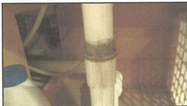
6.0 Item 1(Picture)

Plumbing drain joint on basement kitchen sink caulked.