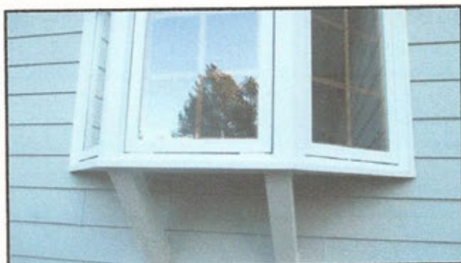
2.2 Item 1(Picture)

Bay window above kitchen sink has little or no insulation under window.