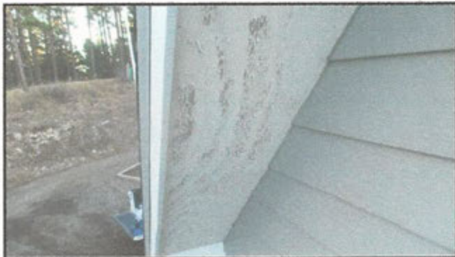
2.5 Item 1(Picture)

Soffit needs painted on garage side of house