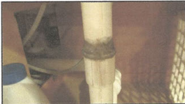
6.0 Item 1(Picture)

Plumbing drain joint on basement kitchen sink caulked.