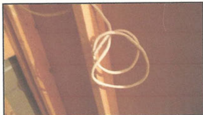
7.2 Item 1(Picture)