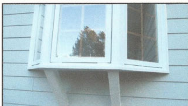
2.2 Item 1(Picture)

Bay window above kitchen sink has little or no insulation under window.