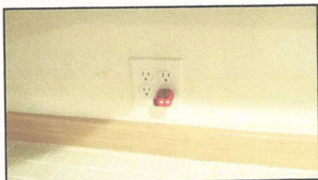
7.4 Item 1(Picture)

Basement kitchen should be gfi protected