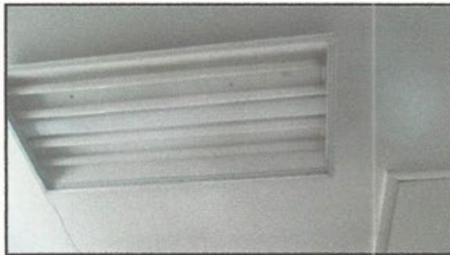
3.0 Item 2(Picture)