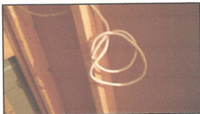
7.2 Item 1(Picture)

Loose wire in upstairs storage room off bedroom