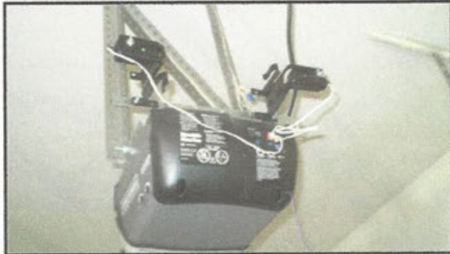
3.5 Item 1(Picture)