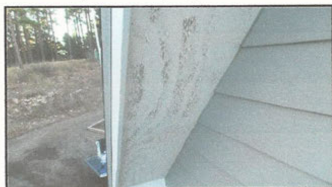
2.5 Item 1(Picture)

Soffit needs painted on garage side of house