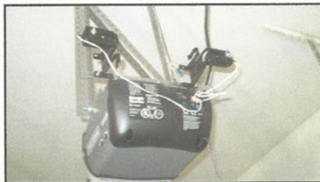
3.5 Item 1(Picture)