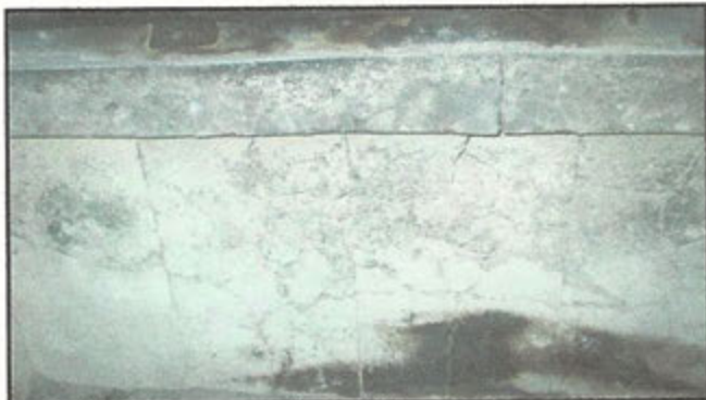
8.6 Item 1(Picture)

Fire block in back of wood burner needs replaced