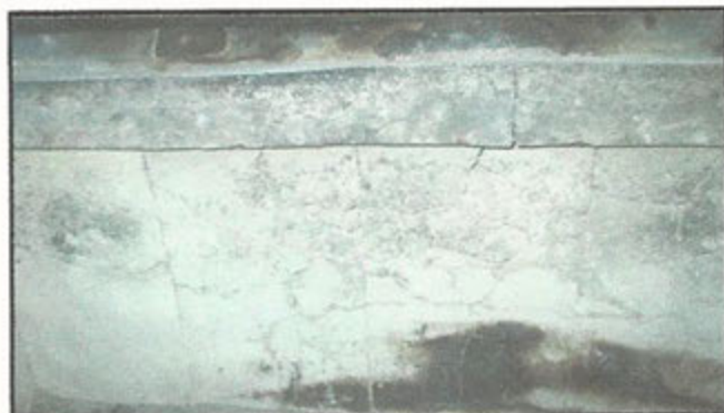
8.6 Item 1(Picture)