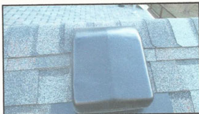
1.2 Item 1(Picture)