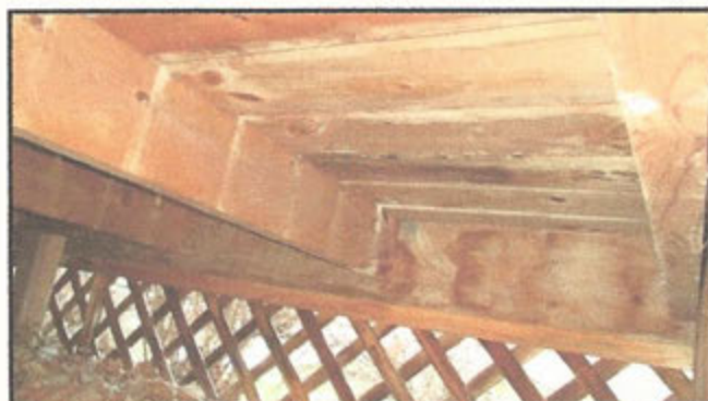
2.3 Item 1(Picture)

No joist hangers on front of front deck.