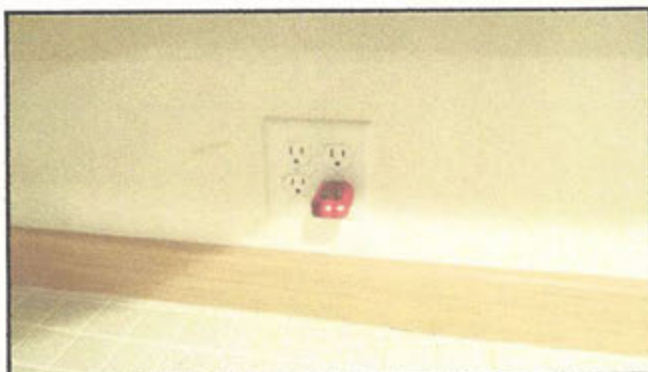
7.4 Item 1(Picture)