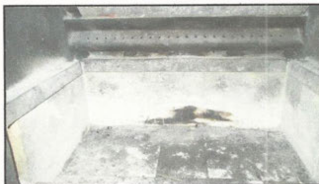
8.6 Item 2(Picture)