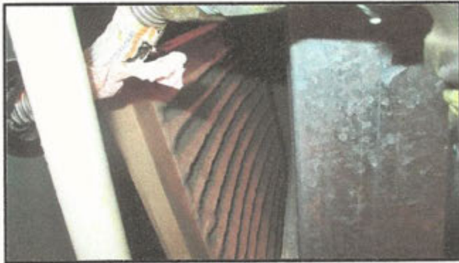
8.3 Item 1(Picture)