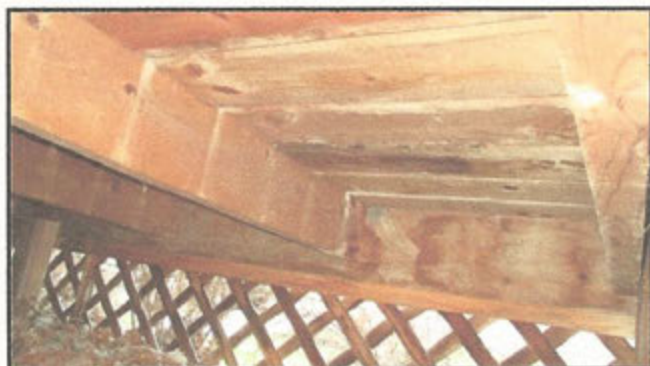
2.3 Item 1(Picture)

No joist hangers on front of front deck.