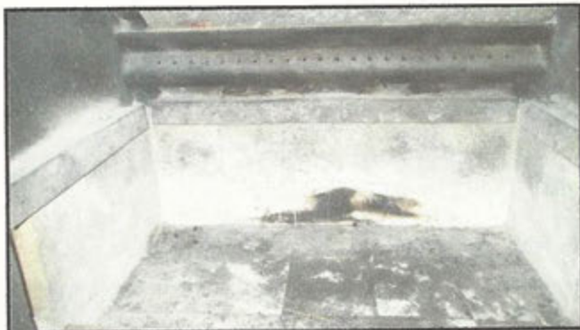
8.6 Item 2(Picture)